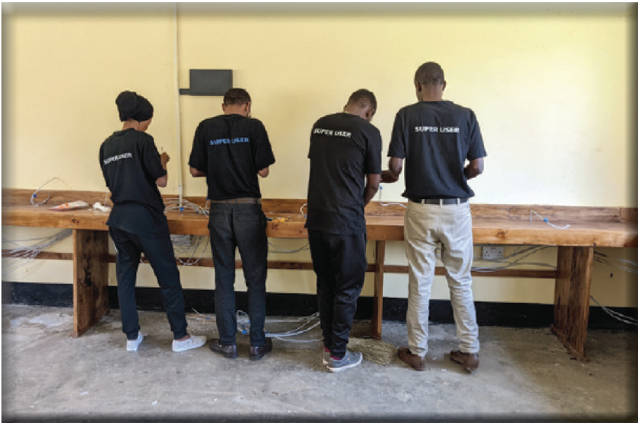
Reneal Team Tanzania Technicians

Reneal formed new partnerships with Terrawatu and Teacher-in-a-Box to increase impact in Tanzania