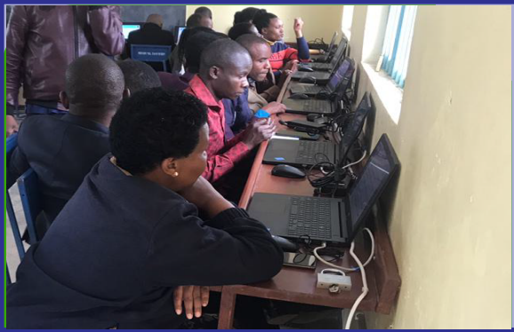
Nangara Secondary School