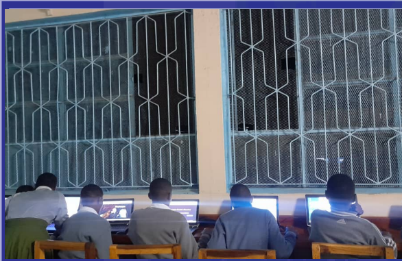
Irkisongo Secondary School