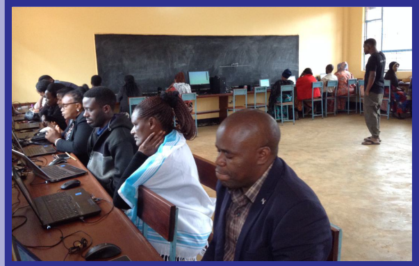
Kwaraa Secondary School