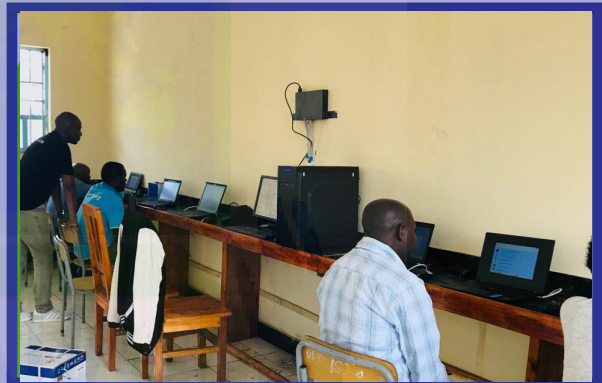
Oledemeye Secondary School

"I want to convey my gratitude to all Reneal International Education Outreach Organization who work tirelessly to make sure Tanzania Secondary Students having early knowledge of computer studies and through your program it has been able to help Teachers to simplify teaching method which helps the students to understand fast than before" - - Arusha Day Secondary School.